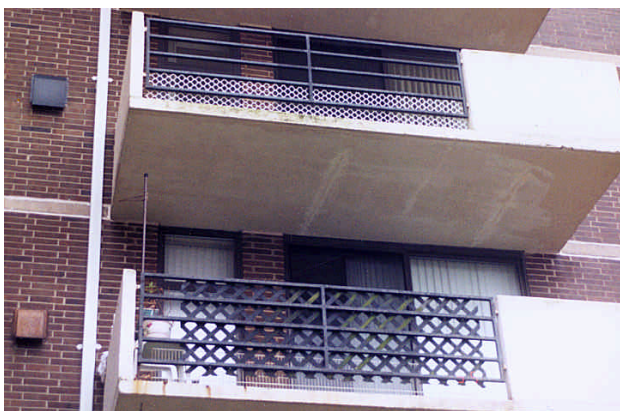
Management had been "child-proofing" individual balcony guardrails as best it could. These rusted guardrails were replaced with new galvanized steel as part of the re-cladding.

Our water testing and exploratory openings showed that no effective flashings had been used in the original design, and that water was entering at the exposed edges of concrete floor slabs. In this case we recommended EIFS, because the exterior walls consisted of vertical panels of masonry.