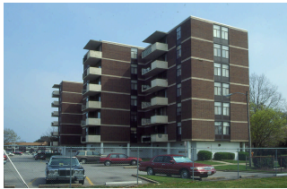
The original construction had concrete floor slabs exposed at the edges, a source of chronic leakage

In another similar case illustrated below, we worked with a 127,000 sf apartment rental property in Virginia Beach that had a history of leakage.